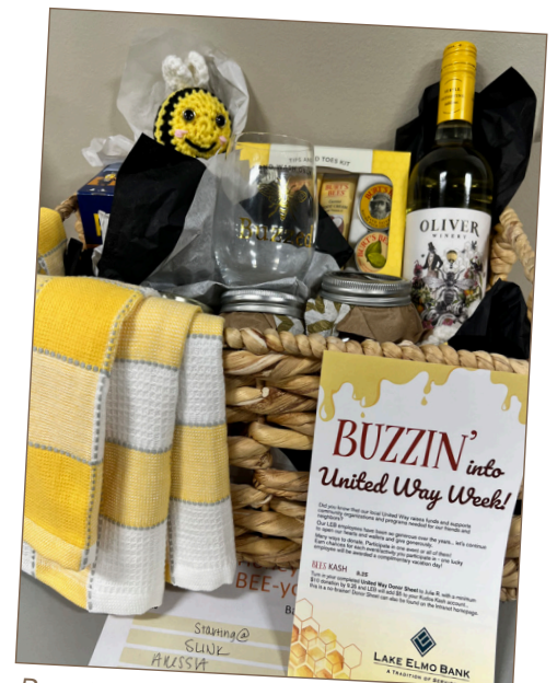
Buzzin' into United Way Week Silent Auction baskets.